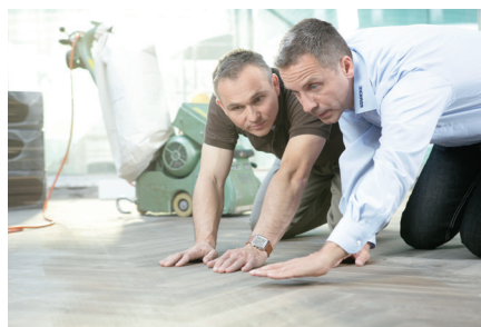
Sanding belts | Plane and Finish sanding