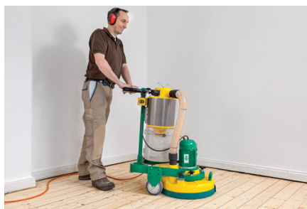
Multi disc sander