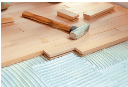
Solid parquet and floor boards