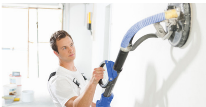
Painter and drywall builder